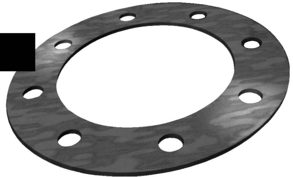
Colour - Black