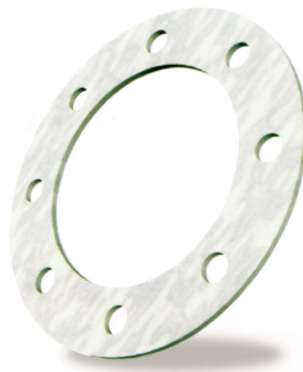
Colour - Off White