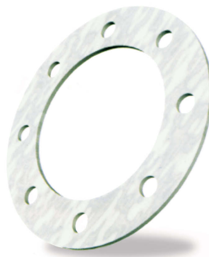
Colour - White

Manufacturers and distributors of sealing and Jointing Materials